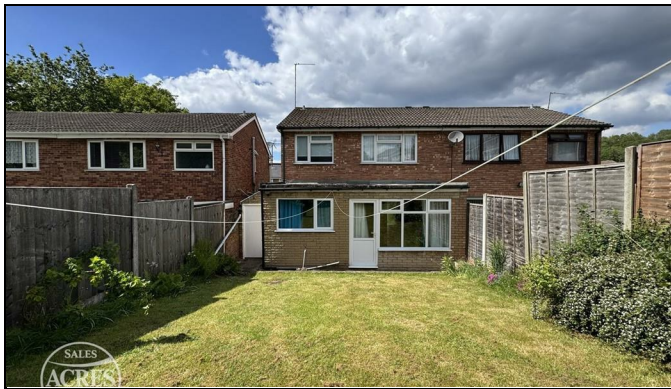
Spouthouse Lane, Great Barr, B43 5PX